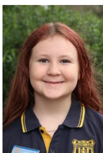
Arora Deputy Prime Minister