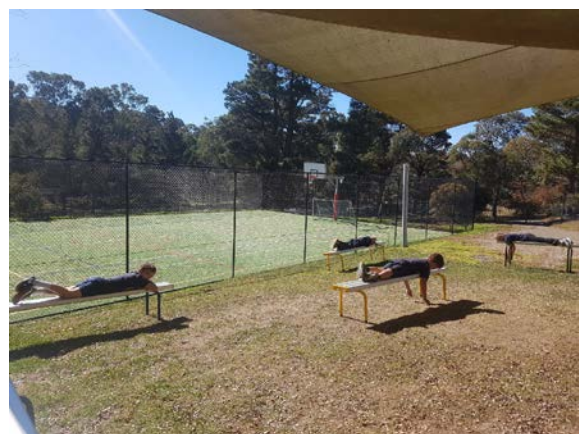
Our Naplan students having a well deserved rest after their testing.

We have learned all about our surrounding environment in our science unit "Look up and around"